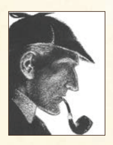
HABITS AND PERSONALITY

WATSON DESCRIBES HOLMES AS "BOHEMIAN" IN HABITS AND LIFESTYLE. ACCORDING TO WATSON, HOLMES IS AN ECCENTRIC, WITH NO REGARD FOR CONTEMPORARY STANDARDS OF TIDINESS OR GOOD ORDER.